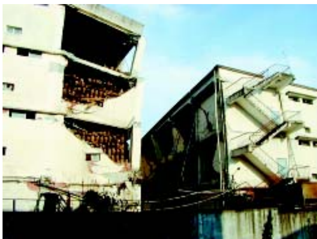
Damage to rice wine aging buildings at the Puli winery.

Varying degrees of damage to industrial facilities were observed. Aggregate and concrete batch plants were damaged heavily throughout Taiwan. Silos and hoppers with heavy fill loads collapsed, causing severe damage to adjacent structures and equipment as they fell. Within