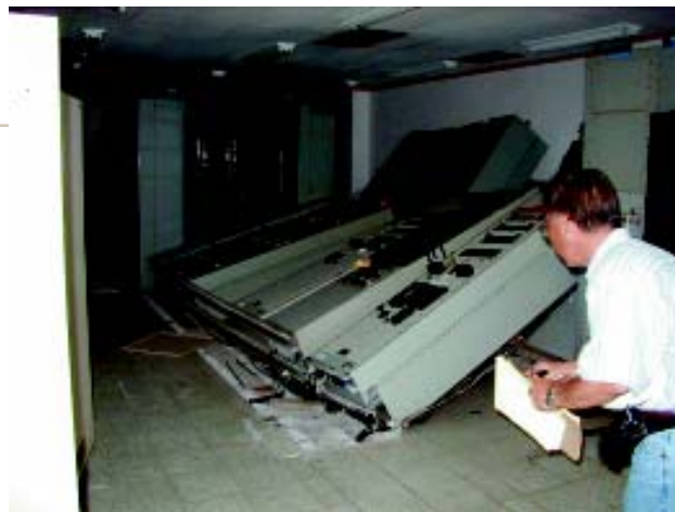
Topped control equipment in 345 kV Chungliiao substation.

There are two nuclear power plants in the northern end of the island, Chinshan and Kuosheng. Neither of these plants had earthquake damage. They were tripped off-line due to failures in the transmission grid system when they could no longer meet the demands of the northern part of the island. The Maanshan plant at the southern tip of the island did not trip. However, due to both substation and transmission tower damage, electrical power produced by power plants in the southern part of the island could not be transmitted to the northern part.