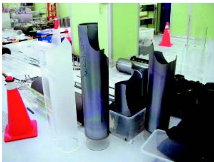
Widespread damage to quartz tubes in wafer fabs demonstrates vulnerability of wafer processing equipment to earthquakes (left photo).