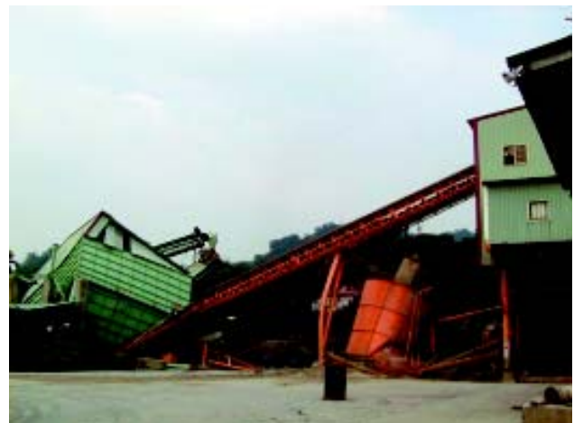
Typical collapse of aggregate and concrete batch plants, which is one of many in the epicentral area.

At Taichung Port, about 70 km from the epicenter, many large flat-bottom steel storage tanks containing molasses were affected by the earthquake. Sloshing of the contents caused heavy damage to the roof and walls of the tanks, resulting in content spillage. A nearby food processing plant had several grain silos, which were filled with product by plant operators because of an impending typhoon predicted before the earthquake. When the earthquake hit, all of the full silos collapsed.