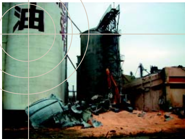
Collapsed grain silos located in Taichung.

There are a few industrial park areas in the cities of Nantou and Taichung. Moderate damage occurred to reinforced concrete-frame buildings with concrete walls or brick infill walls. Equipment slid or overturned within many facilities, resulting in extended business interruption that could have been easily avoided by equipment anchoring. A steel-frame warehouse building was heavily damaged, leaning to one side, when its columns failed due to the impact of collapsing storage racks inside of the building.