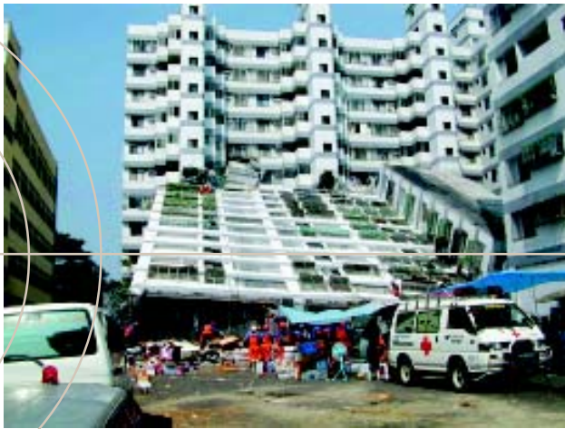
Collapsed 12-story condominium in Tali.

More than about 5 km from the fault line, it was repeatedly observed that the older buildings performed well, but many of the modern structures over six stories tall performed poorly. This can be attributed to faulty design and construction, and improper enforcement of seismic design provisions in the building code - even though the building code used in Taiwan is comparable to those used in Japan and in California.