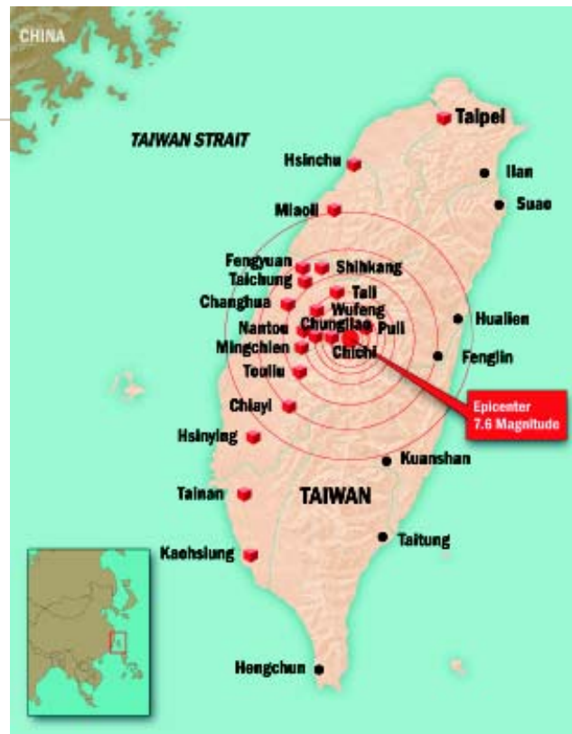
Map of Taiwan showing epicenter of Chichi earthquake and nearby cities.

Taiwan is located along a zone of collisional convergence between the Eurasian plate and the Philippine Sea plate. On Taiwan, the zone of collision is marked by NE-trending zones of thrust and strike-slip faulting. A primary zone of thrust faulting follows the Western Foothills of Taiwan, in close proximity to the city of Kaohsiung on the south and the city of Taipei on the north. This earthquake occurred near the center of this zone.