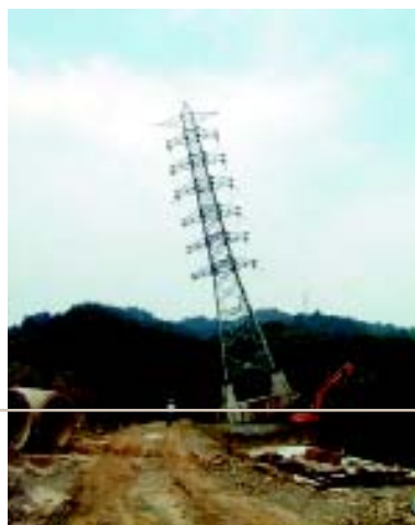
Foundation failure of a transmission tower due to fault rupture in Mingchien.

in land use planning, mitigation and building retrofit programs, and improvements in building construction practices.