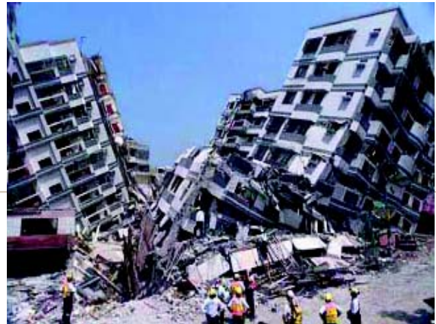
Collapsed condominium complex in Touliau.

about 40 km of the fault line, damage was observed at essentially every aggregate and concrete batch plant. The seismic design practice that is used for the design and construction of such facilities clearly requires a major revision.