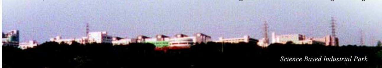
Science Based Industrial Park

Varying equipment damage was reported in the Science Park manufacturing facilities. The worst reported damage entailed breakage of quartz tubes inside vertical diffusion furnaces. Most of the wafers contained in the quartz "boats" were also cracked when they were tossed during the shaking. There were many cases of process equipment shifting, and at least one case where a tall cabinet overturned. Fortunately, there was no report of fire or toxic gas release due to the damaged tubing. Had