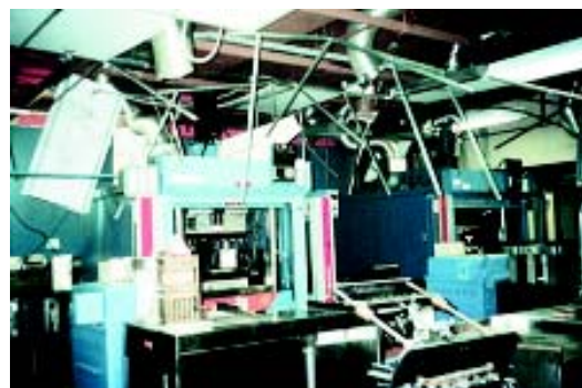
Damage to typical high-tech facilities in the 1990 Philippine earthquake (bottom photo).