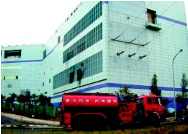
Fire damage due to a standby generator failure in the Hsinchu Science Park.

the shaking been even slightly stronger, damage and loss would have been much more extensive. Such damage to typical high-tech facilities occurred in the 1990 Philippine earthquake.